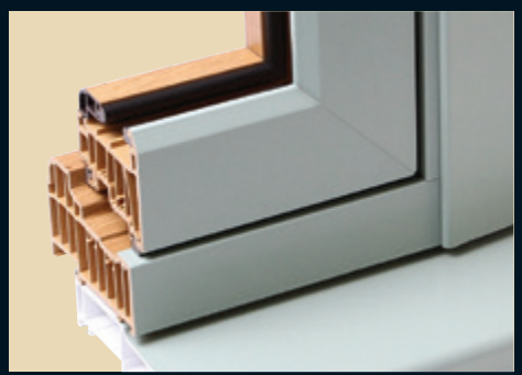
Dual foil upgrades. Foiled through the rebate as standard