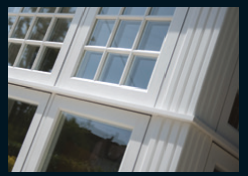
Flush external finishes with equal sightline and external transom bar upgrade