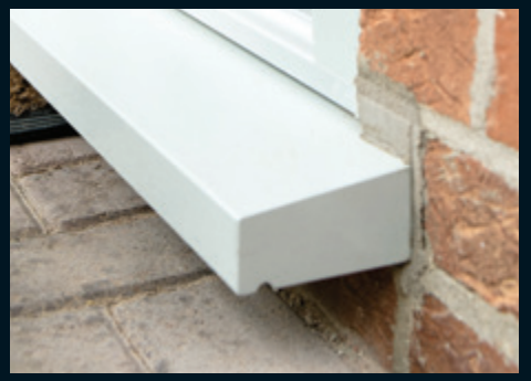
55mm Radlington cill option

Astragal Bar Grids supplied Fully Glazed