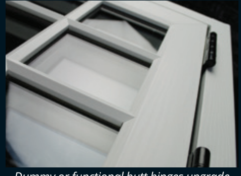
Dummy or functional butt hinges upgrade