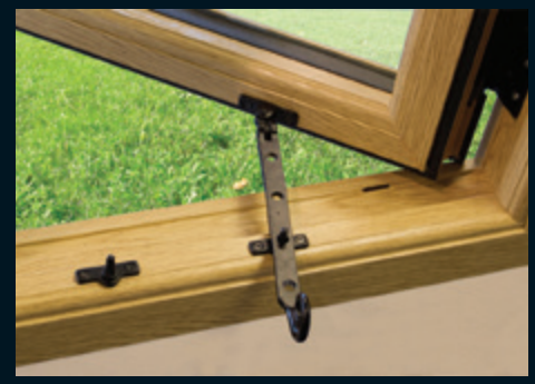
Dummy or functional stays upgrade