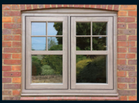
20mm Astragal and 60mm Transom bar upgrade