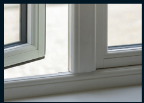
Residence9 has a traditional, decorative, internal finish