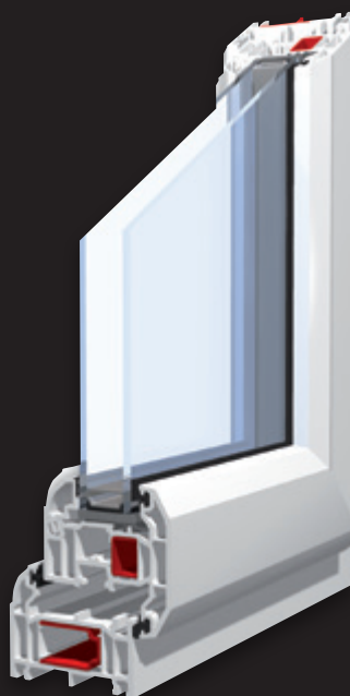
Legacy Sculptured inside Chamfered Outside