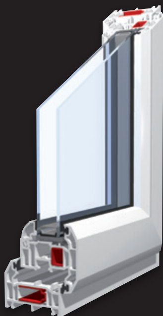
C70 Slim Sash