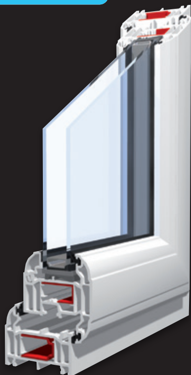
070 Fully Sculptured

Kömmerling 070 and C70 versatile product range available in a wide range of colours, gasket and Astragal bar options double or triple glazed.