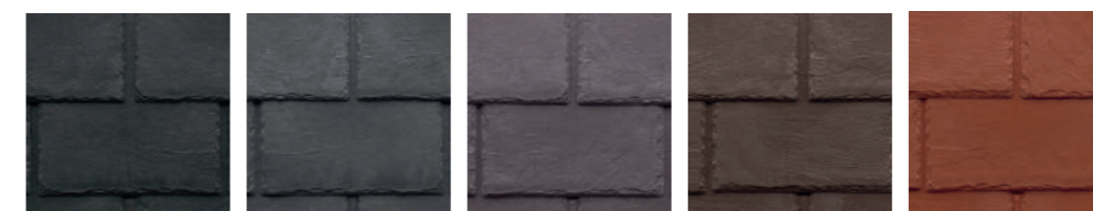
Stone Black Pewter Grey Plum Chestnut Brown Brick Red

TapcoSlate tiles are authentically shaped with textured surfaces and riven edges moulded from authentic slates that make them indistinguishable from natural slate. It is made from a recyclable blend of limestone and polypropylene. TapcoSlate tiles will not crack, break or delaminate, and its product formulation and manufacturing processes provide durability, performance, and longevity for many years. The TapcoSlate tiles come with a 40 year warranty and 5 standard colours as well as 9 alternative colours.