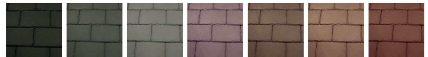
Charcoal Ash Slate Grey Amethyst Oak Sunshine Sunset

Britmet's Liteslate is an innovative synthetic slate roofing tile made from 90% recycled polymers with all the characteristics you can expect from a traditional slate tile. Liteslate offers an authentic finish with riven edges, traditional colour choices and impeccable durability. Unlike natural slate, as a synthetic slate roofing tile, Liteslate won't crack, break, chip or delaminate due to its ground-breaking design and cutting-edge manufacturing process. Furthermore, the Liteslate is designed with the environment in mind. Over 90% of the Polymers that Liteslate is made from are recycled. Available in 7 colour finishes with a 40 year guarantee against weather penetration.