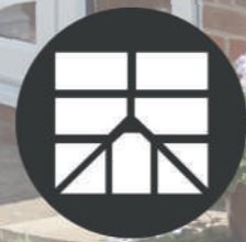
Edwardian or Georgian